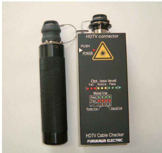
OPS connector type