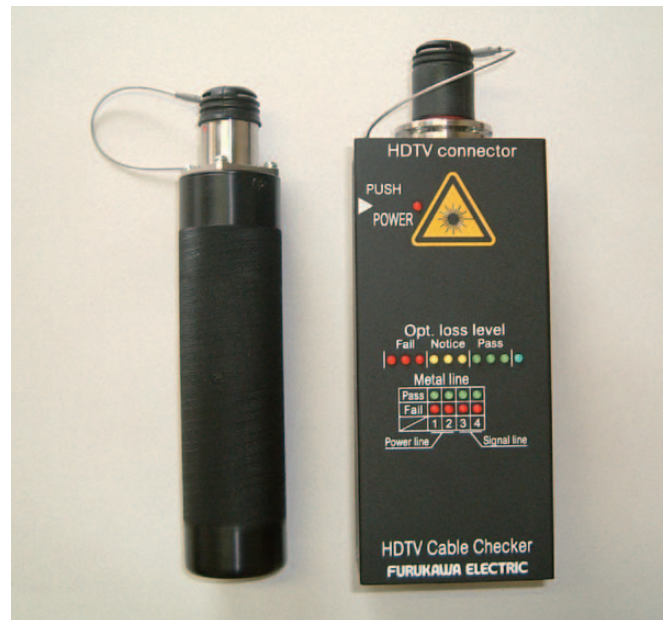
LEMO connector type