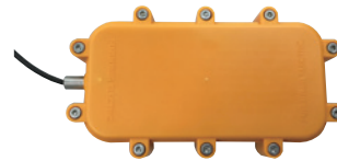
Compact water gauge

The water level and the liquid surface level in the sewer pipe, river, manhole and utility enclosure are measured. It is ideal to measure the water level at multiple points to monitor the effects of unexpected strong rain. A separate power supply is not required.