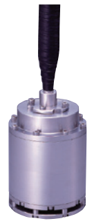
Optical fiber water gauge sensor