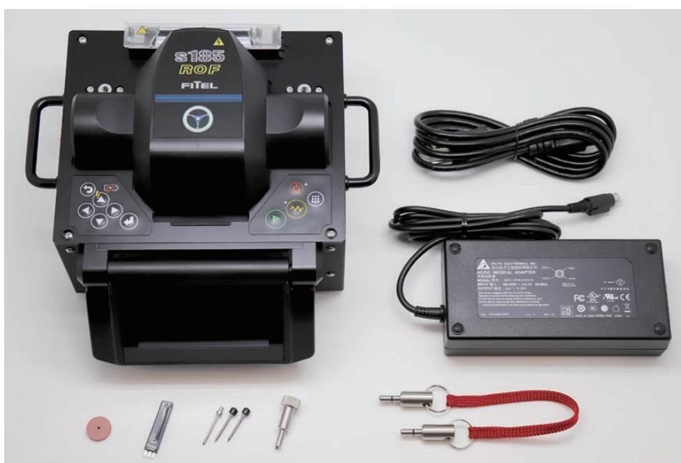
Figure 1 Appearance of S185ROF.

The resolution of the centering mechanism used for the axis alignment of the optical fibers has been improved three times compared to the conventional model, enabling more accurate axis alignment. In addition, the image processing system has been improved to expand the observation range so that the entire fiber can be imaged even with an ultra large diameter optical fiber. Furthermore, the resolution of the rotation mechanism required for the alignment of the polarization maintaining optical fiber is doubled compared to the conventional mode and the rotation range is expanded from 270° to 360°. Therefore, the accurate and speedy rotation alignment can be performed.