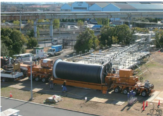
Figure 4 Installation of the ultra-long power EHV cable.