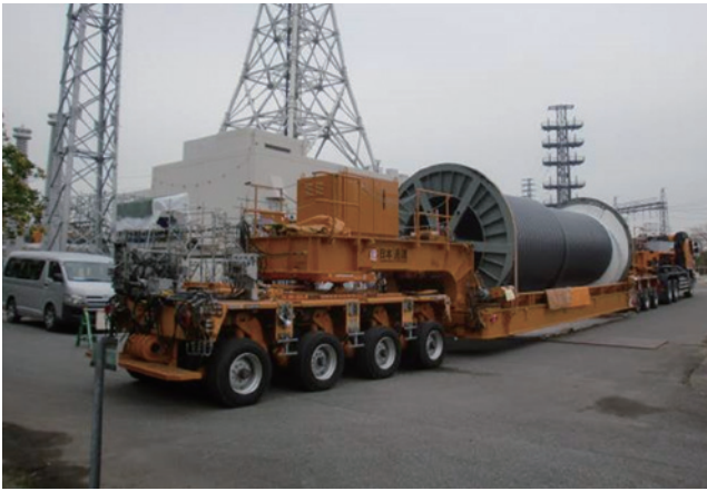
Figure 3 Ground transportation of the ultra-long power EHV cable.